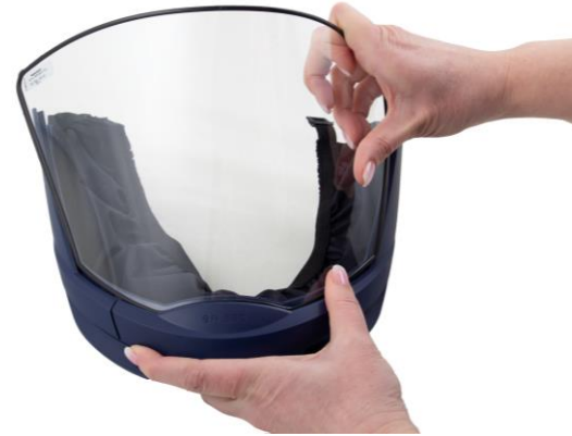
5.3 Remove the visor