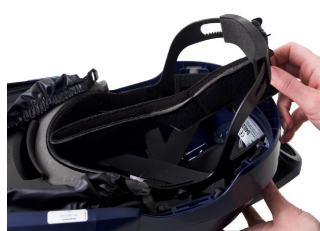
7.3 Fit the Velcro tape with the rough side towards the forehead strap and the groove facing upwards.