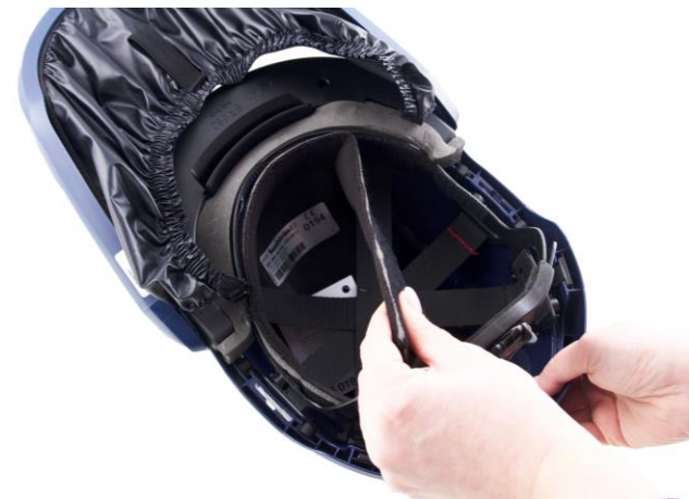
7.2 Remove the sweatband.