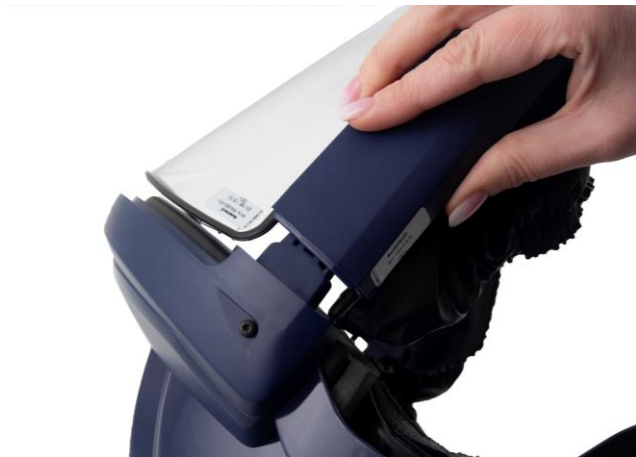
5.2 Remove the lower visor frame